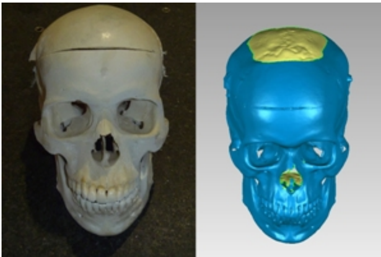
Actual skull (left) and Scan (right)

NVision Inc. , [1] a leader in 3D non-contact optical scanning for over 21 years, recently provided an orthodontic company with the information it needed to recalibrate its CT scanner. The company, an orthodontic supplier, utilized NVision's Engineering Service Division to scan a human skull as part of the verification/inspection process for its in-house CT machine. The scanning results provided by NVision contained all the measurement data necessary for the orthodontic company to recalibrate its CT machine to the highest possible level of accuracy.